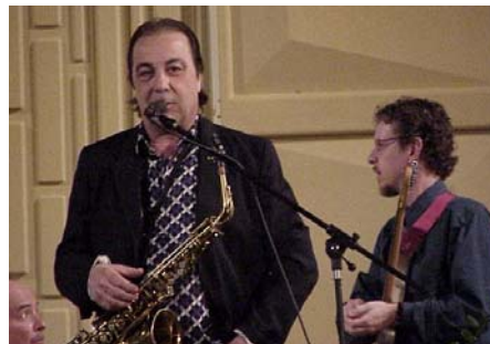
Internationally known jazz saxophonist Greg Abate performed at the Holland Theatre with the Kent Burnside Trio.