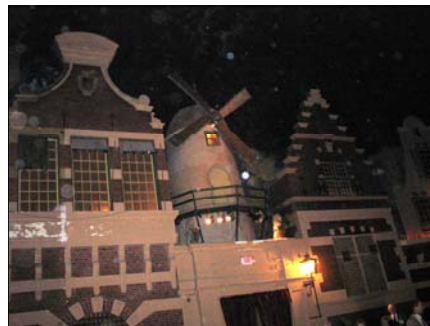
On April 14th one of the windmills in the auditorium of the Holland Theatre turned for the first time in many, many years.