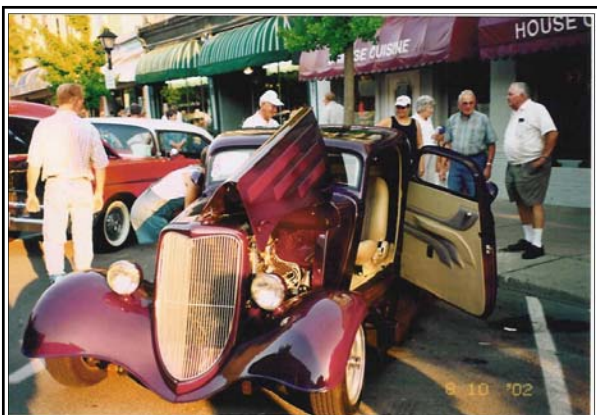
One of the classic cars from a past Cruise-In

The 2005 Cruise-In sponsored by the Top of Ohio Cruisers will again fill the downtown area of Bellefontaine with classy classic cars. Each year the annual car show seems to grow in numbers and quality.