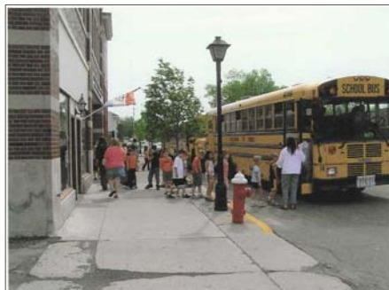
School children board busses in front of the Holland. Three matinee performances of "Charlotte's Web" were presented for the elementary schools in the area.