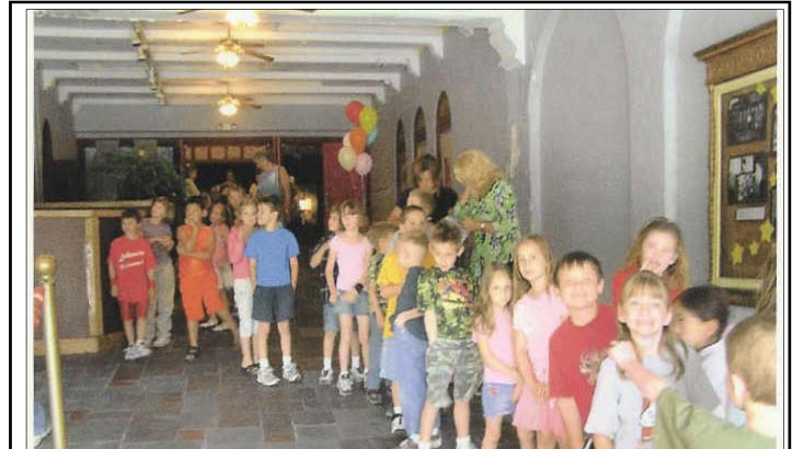
Happy area elementary students line up following a performance of "Charlotte's Web" at the Holland.

Also included in Stage Three are critical upgrades to the stage area. These upgrades will enable the Holland to host professional acts whose demands are currently unable to be met. The improvements include a new stage floor and limited lighting upgrades. Minimal curtains and rigging to hold the temporary curtains are needed and will improve the sound in the auditorium. Dressing rooms will