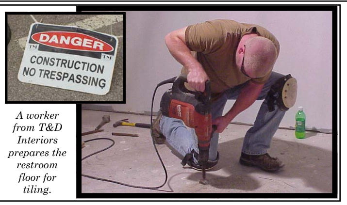
A worker from T&D Interiors prepares the restroom floor for tiling.

The women's restroom is being moved across the lobby to where the men's restroom was located. It has been enlarged and redesigned with all new fixtures, plumbing and floor and wall treatments. It is hoped that the work on the restroom will