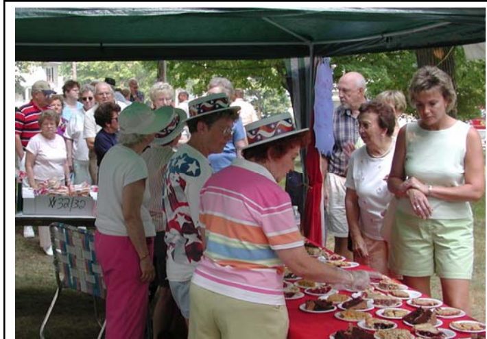
Members of the Programming Committee and volunteers help work at a variety of special events and programs to help benefit the historic Holland Theatre. Here workers man the tent at the Ice Cream Social at Brown Park

The Program Committee's job is to plan entertainment in the Theatre and organize special