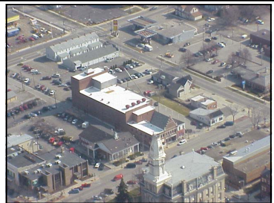
A bird's eye view of the new roof at the Holland and the surrounding downtown area.