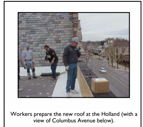
Workers prepare the new roof at the Holland (with a view of Columbus Avenue below).